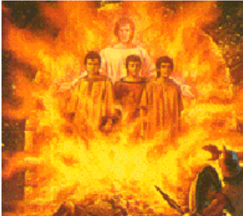
Three Men Invited to a Bar-B-Q

kingdom work. We look at the effectiveness of the fruit in our life through our children, our friends, etc. Who do we hook up with?