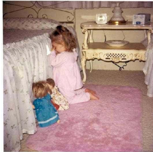
God's Situational Control

“ . . . I haven't wrote you cuz I thought I would catch you on the 28 th . I had court that day. My case is still looking good says my lawyer. My next court date is on April 25 th for pre-trial. So I will be here for quite sometime. This time I was not upset at all. There was absolutely no anger at All in me. I felt peaceful and even happy. God knows I am innocent and my life is in his hands. This whole situation has changed me a lot. But that's not all! My family and even my friends have had some spiritual healing. My dad stopped drinking and now goes to church every Sunday. My mom and brothers pray for me night and day. The thing that has shocked me the most is that my friends talk about how their faith in the Lord has grown. They say it's because of this whole situation and how they see how my life and spirits are so different now that I have accepted Jesus Christ. It touched my heart so much to hear that they have found the Lord because of me. It just shows how God has put me here for a reason. There are so many things that are better now because I have been put in this situation. PRAISE THE LORD! . . . “