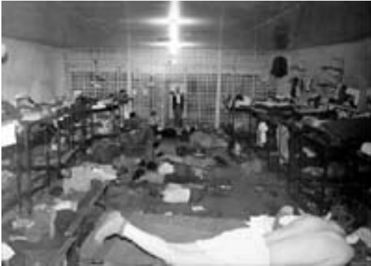
Drunk Tank 1930's

In this Volume 10 issue, we would like to speak to those who are reading this newsletter that are not incarcerated. Do we take our freedom and blessings for Granted?