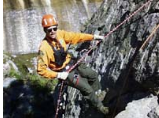
Sheriff's Office doing Rescue

price. Please realize that the price has already been paid, and we are just displaying that payment done by Christ.