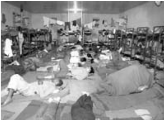
Jail Dorm 1930's

Writing this right now as it is Memorial Day 2005, I think of the price that was paid for freedom. There are also prices to be paid for “Free Will” and sometimes this gives the appearance that we are not free. In realizing that Freedom is always paid with a price. We realize that being behind cell doors is paying a price towards freedom. Being behind cell doors to witness and share the love of Christ appears to be paying a