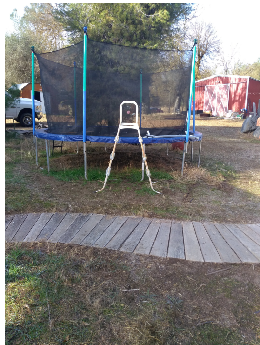
16' trampoline for recreation