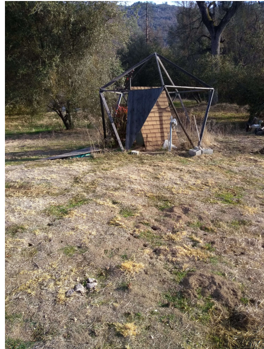
Old pumphouse will come down for dome structure (Have new pump)