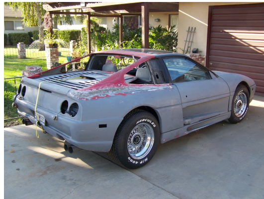
F-355 Ferrari replica in waiting line.