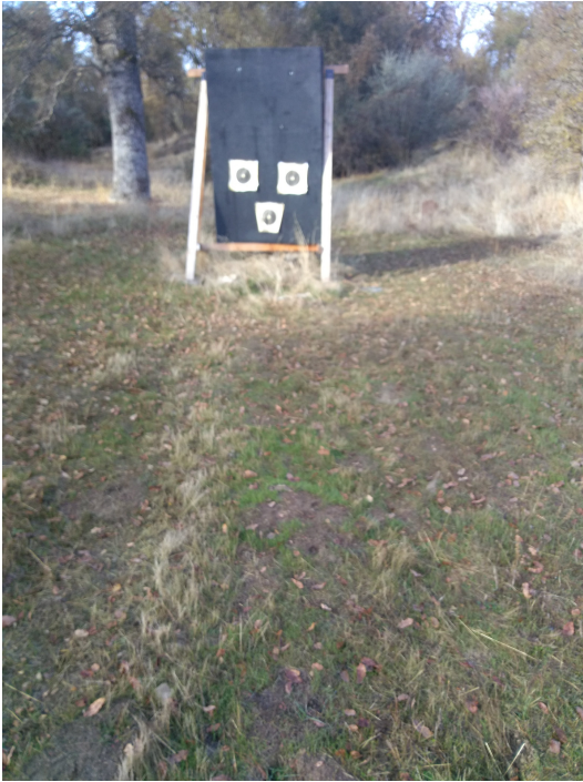
Targets for archery or crossbow