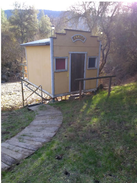
Saloon on pier over creek now used as Chapel