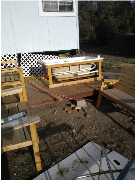
Putting a Jacuzzi Tub in at Cripple Creek resort (Tollhouse area)