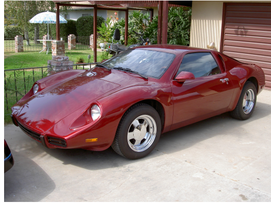
Fierro 600 had paint job.