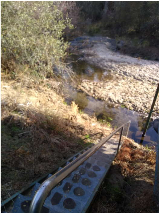
Still some water in the seasonal creek viewing from "saloon."