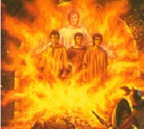
Three Men Invited to a Bar-B-Q

Our text today is about four men who came to a time of decision in their lives. They could either compromise and go with the flow, or they could stand their ground and live for the Lord. The circumstances they faced and the decisions they made set the course for the rest of their lives. Since this incident occurred, the names of Shadrach, Meshach and Abednego have stood tall as the names of great heroes of the faith. These three men were not only invited to the “Bar-B-Q” but were to be the Bar-B-Q (which was cranked up 7 times as hot). As the story went, they could not get them cooked above “rare.”