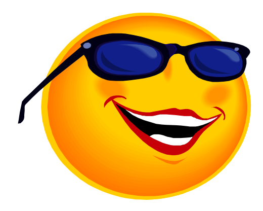
Preguntas? Yo no soy escolar pero si trato de obtener repuestas con el mapa que tenemos: LA BIBLIA.....:>> Dios te ama 100%