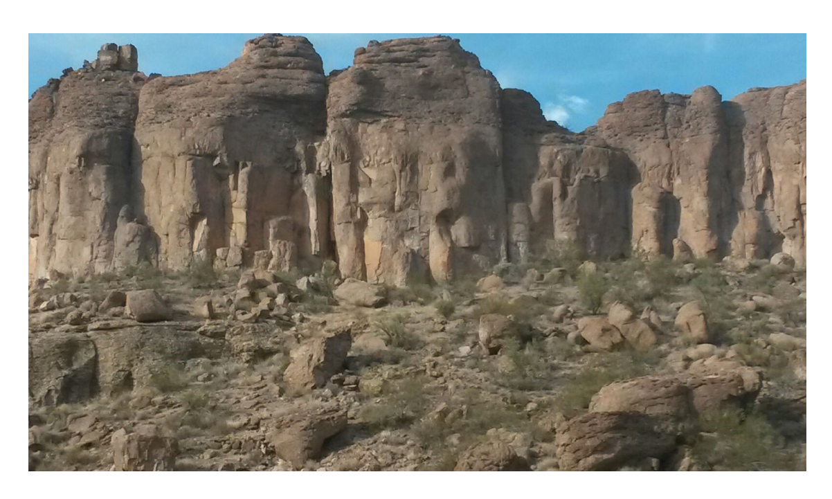
The Majesty and beauty of God's Creation with attention to EVERY detail.