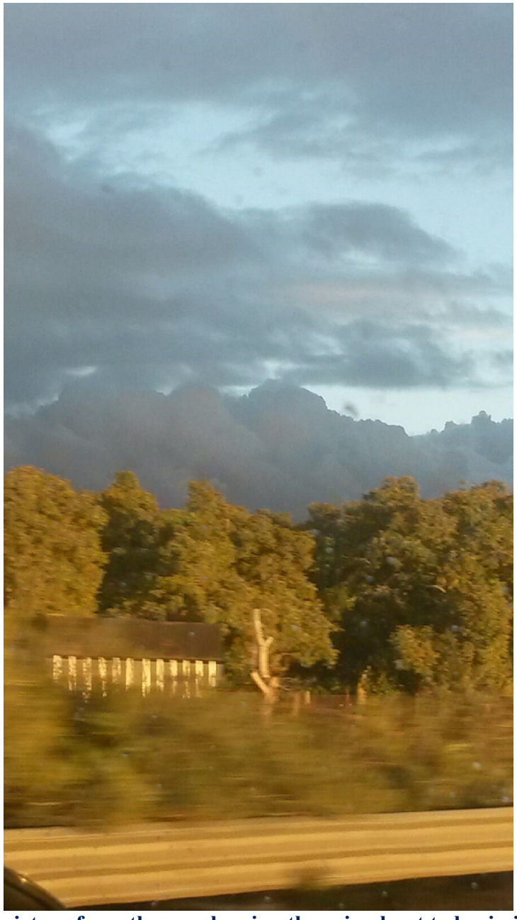
Linda shot this picture from the car showing the rain about to begin in "Sunny" Arizona