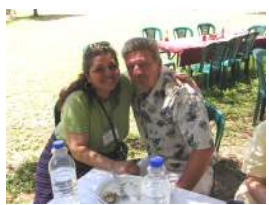
What a great God we serve!!

When my husband asked me to share my testimony I had a picture of my mother and father and the small towns of Fowler and Selma California in my mind. We lived in a three room house with only a light bulb hanging from the middle of the ceiling. There was no plumbing, no bathroom but we did have a woodstove. The outhouse was a distance from the house. We drew water from a well until we graduated to a pump. Years later my "daddy" and "mama" added pipes for a sink and we thought we were rich. We grew all of our own vegetables, had to go out to the henhouse to collect the eggs daily and took care of the Coolidge Ranch consisting of irrigating, pruning, picking grapes, driving tractor etc.... It was the neatest experience. It was survival.