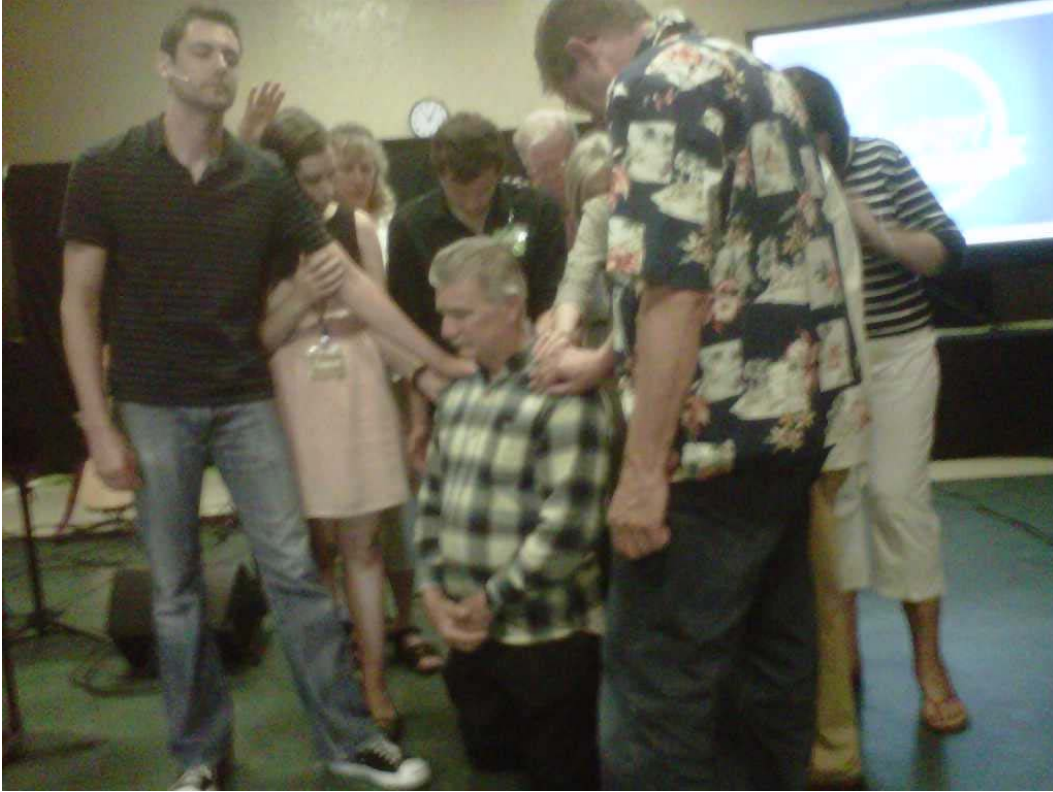
Prayer of Ordination