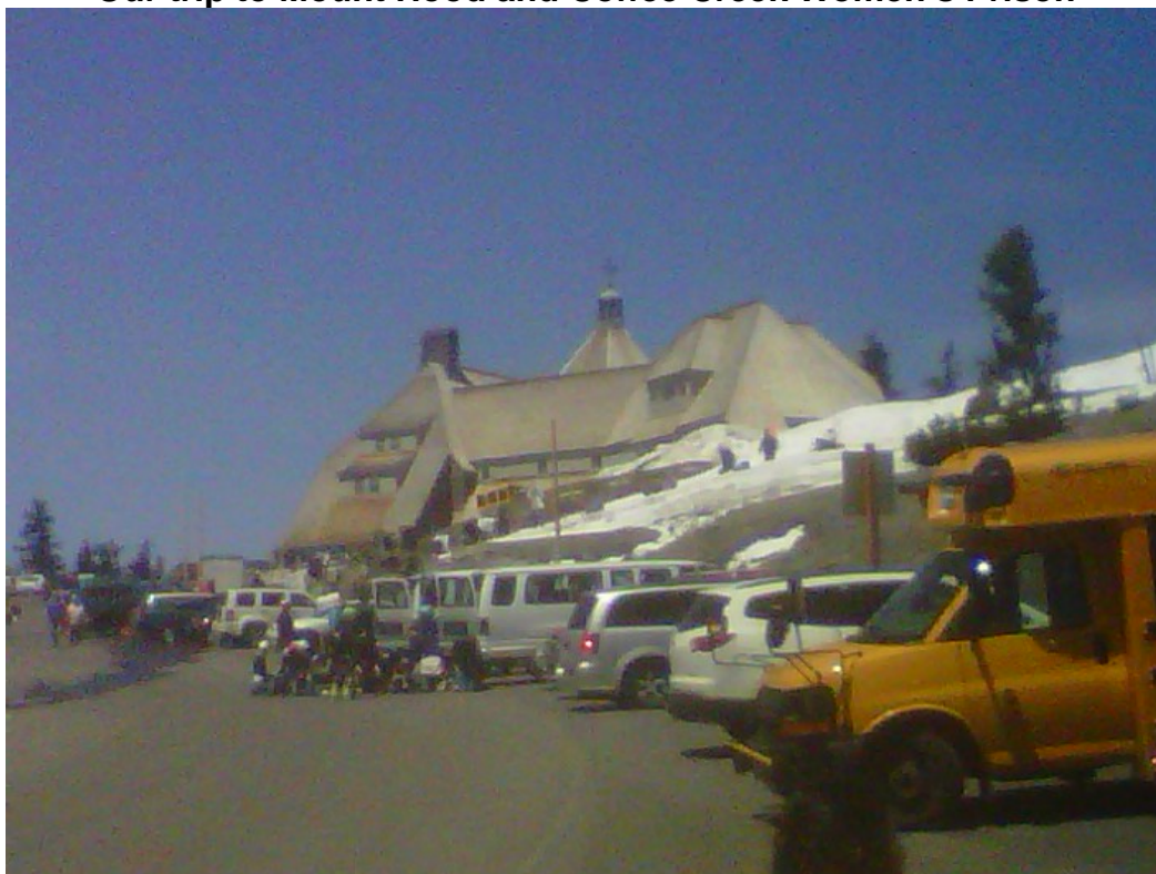
This is Timberline Lodge at Mt. Hood, Oregon