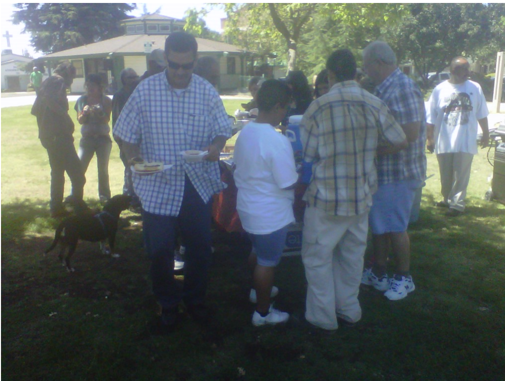
M.O.M. and Awaken provided for approximately 80 people in May & 50 people in June.