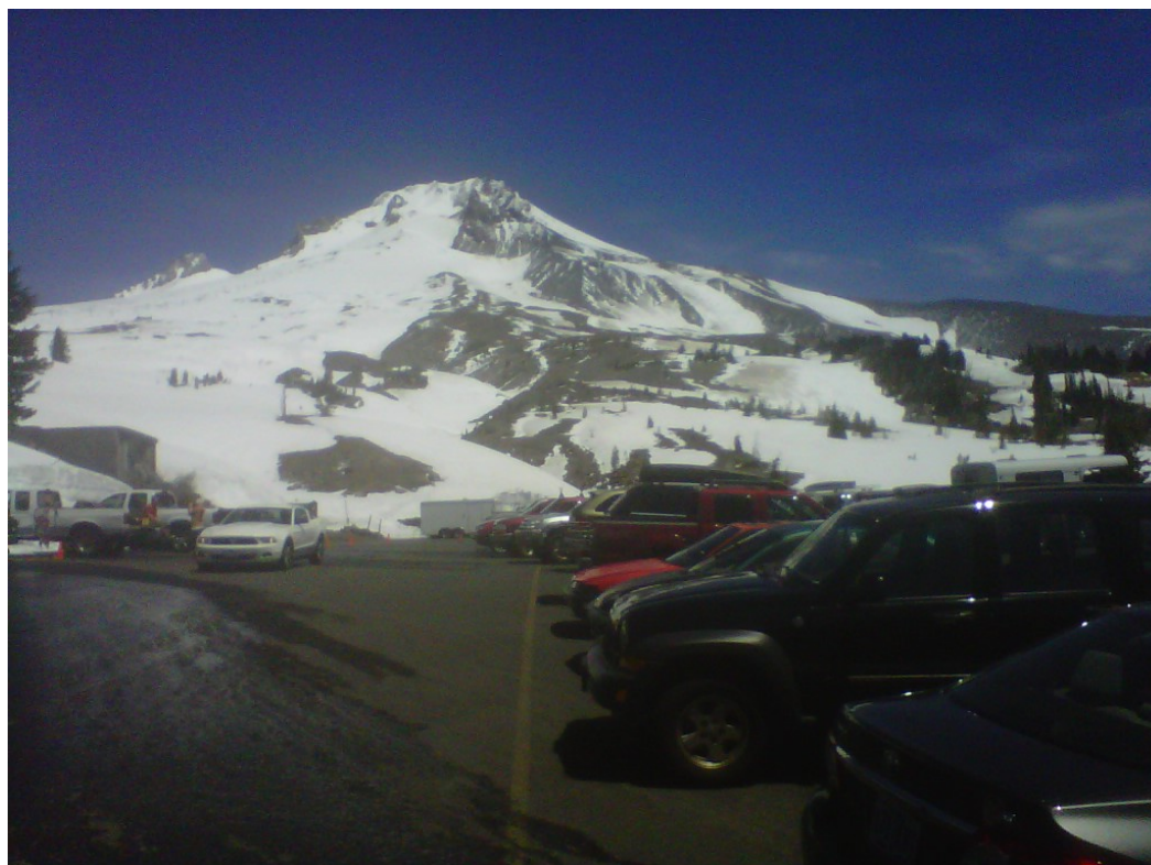
Mount Hood, Oregon – where you can ski ALL YEAR – This was June 2012