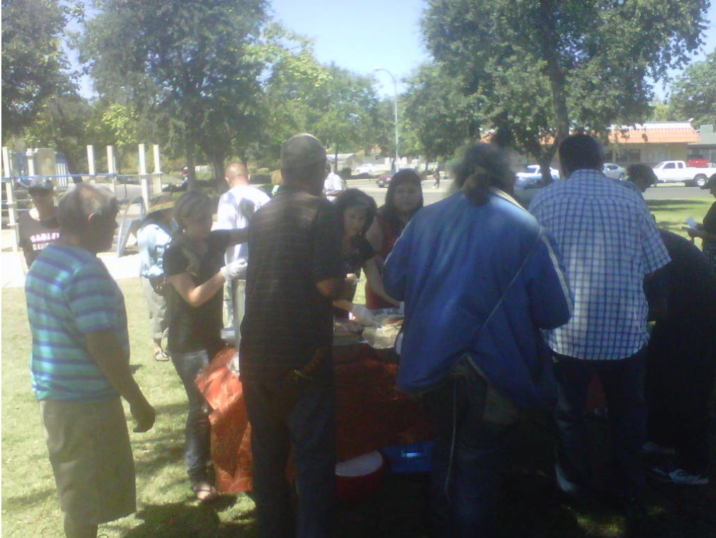
Homeless, hungry and needy being fed