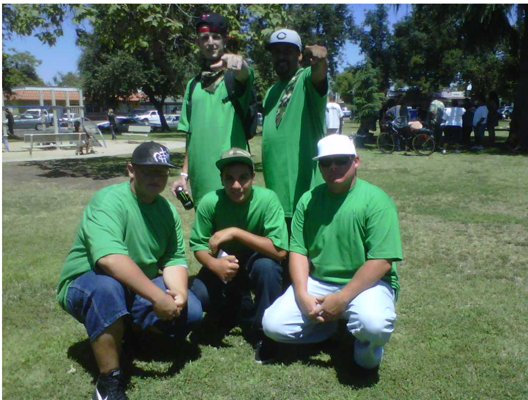
Souljahs for Christ