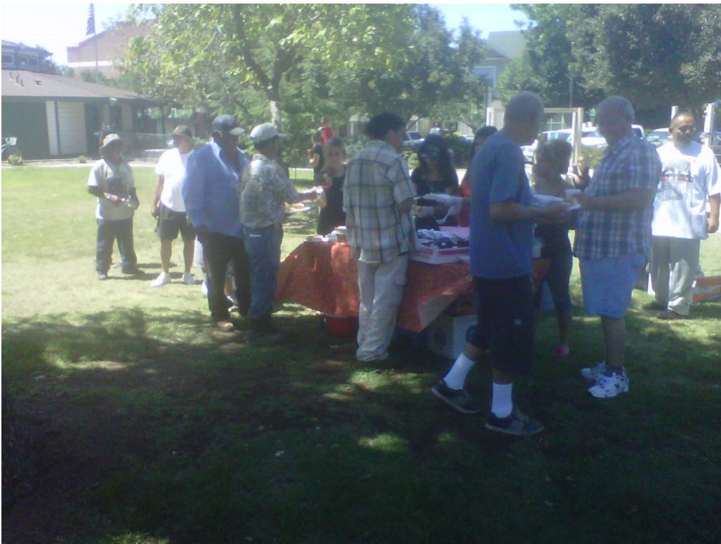
There is always enough to feed everyone – much as Christ did with the 5 loaves and 2 little fishes.