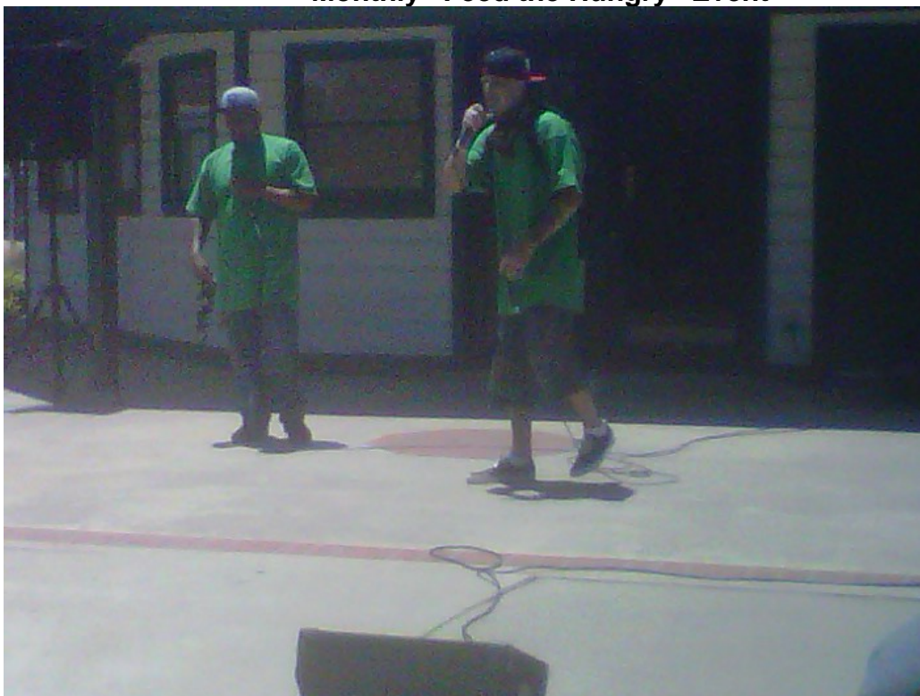
Two of the five rappers from West Coast Believers “ Souljahs for Christ ”