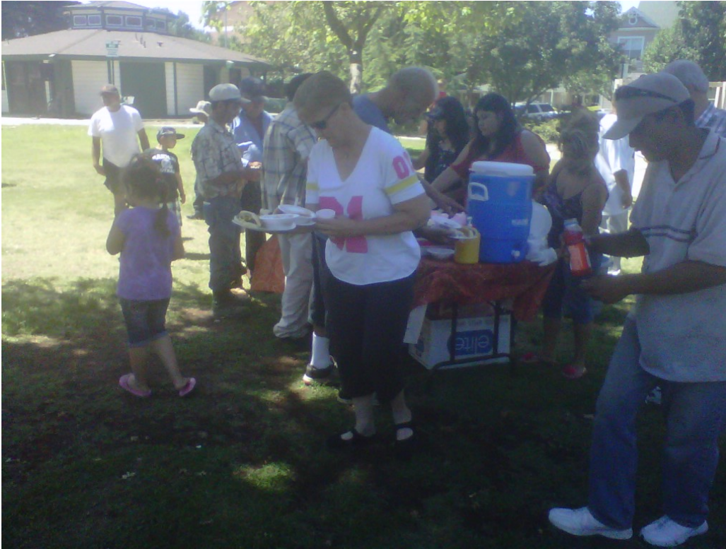
Bar-B-Q'd Hot dogs, beans, macaroni salad, cupcakes and punch