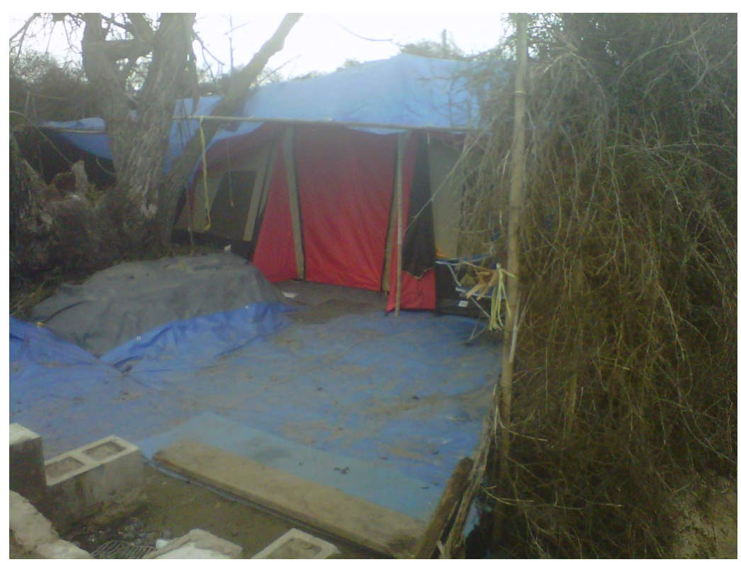
Tent hidden inside of tumbleweed walls. B-B-Q in foreground.