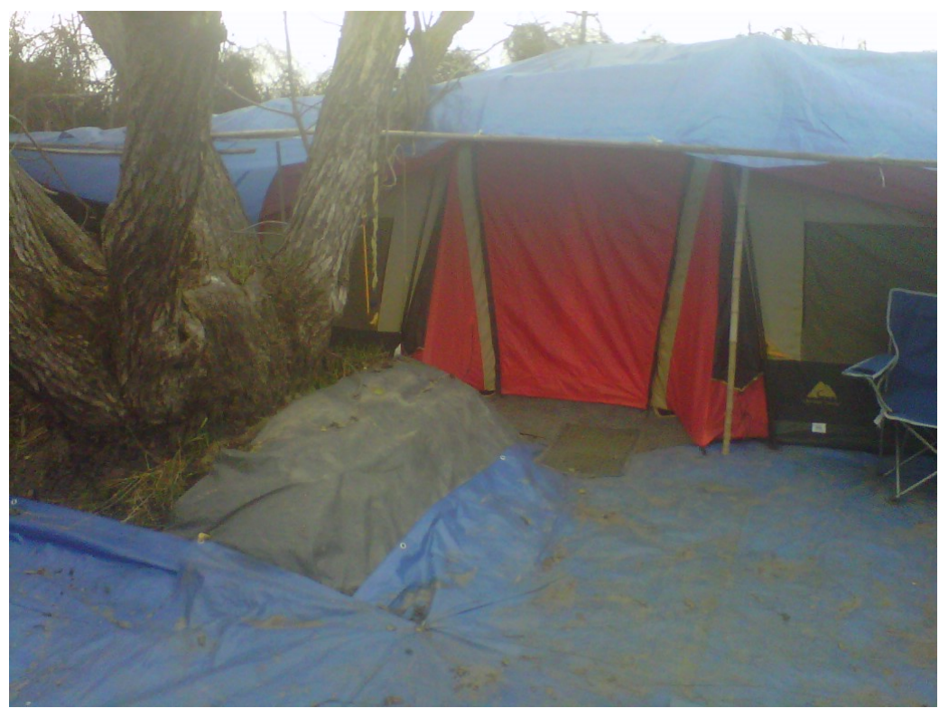
Waterproofing with tarps and even a nice yard chair.