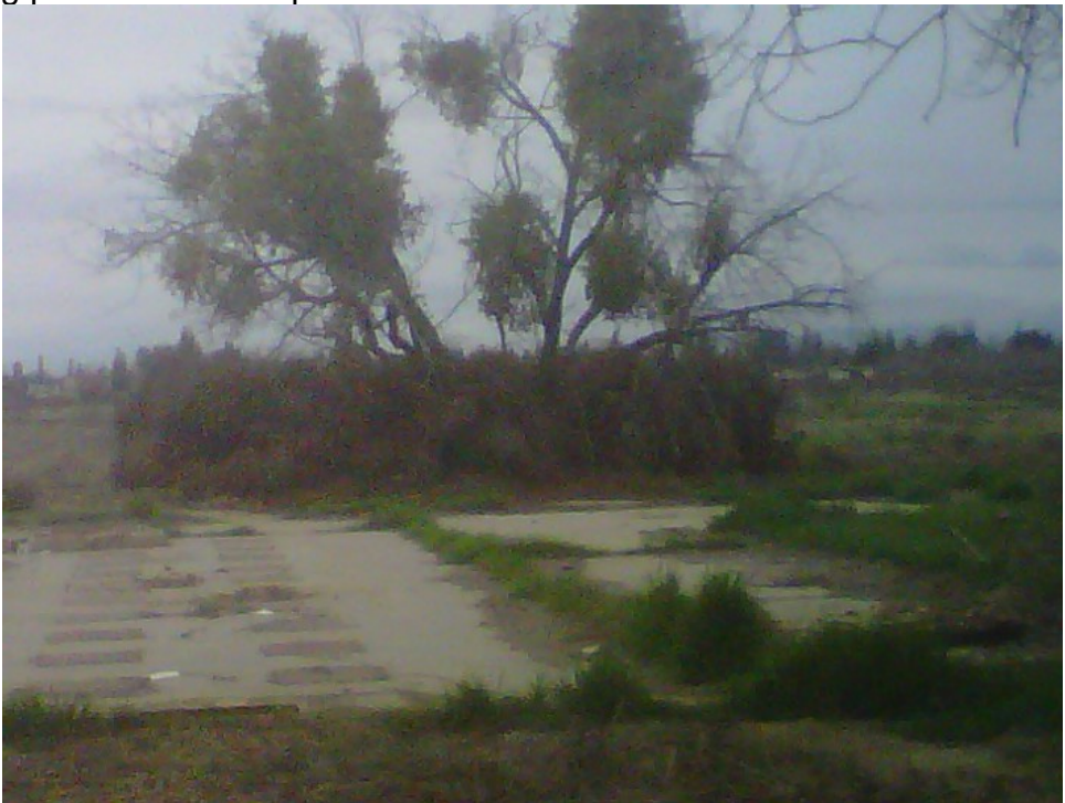
Just looks like a pile of tumbleweeds under a tree

Many of you have asked about our outreach to the homeless. We do feeding once a month (or more) and have included pictures of one of the better equipped "Dwelling places" for a couple.