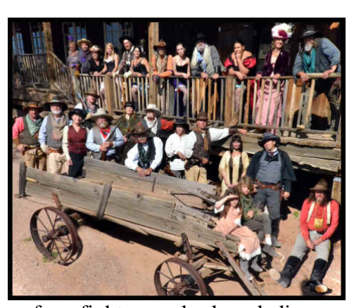
Complete with restored buildings and a whole crew of gunfighters and saloon ladies