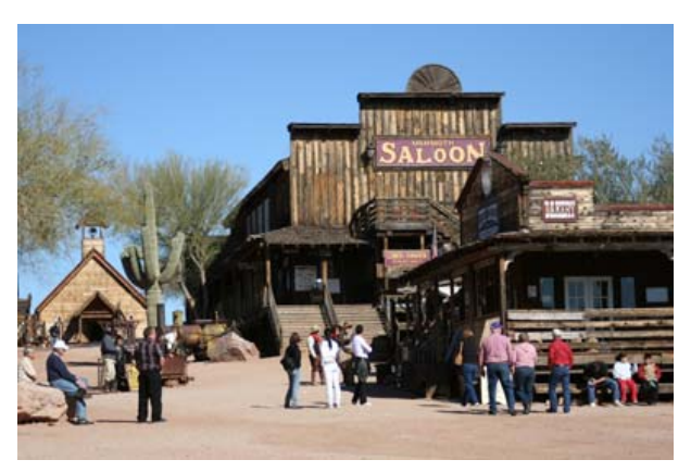
It is believed that there is still 175 Million in Gold in this ground.