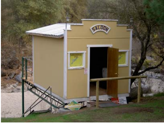
Saloon (to become chapel) that is on pier over creek. Below – Model of (3) cabins