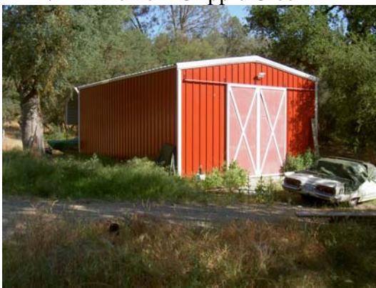
Large shop building (kit cars)