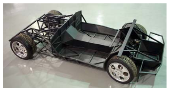
Fame and wheels