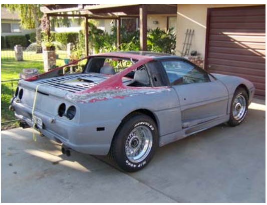
With spoke rims and Ferrari hardtop design.