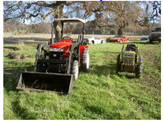
5 acres with lots of work. Going for sale These 2 are fixed, 3<sup>rd</sup> one is in repair.