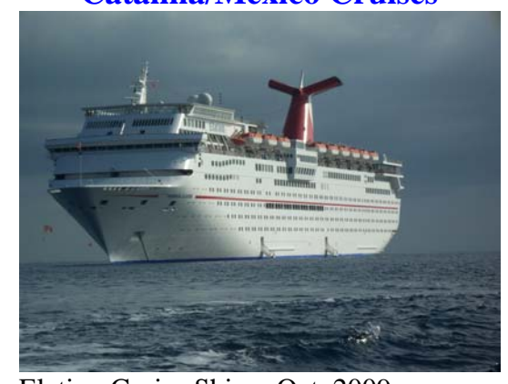
Elation Cruise Ship – Oct. 2009