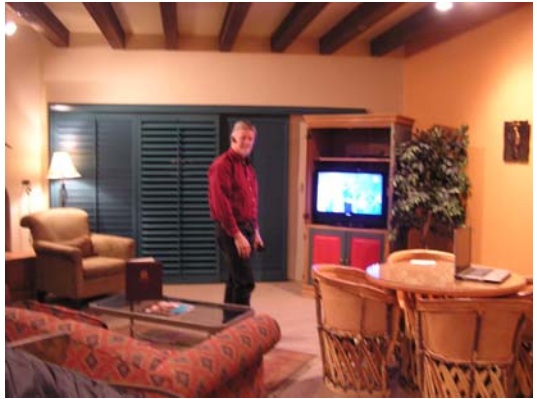
Great & comfortable living room Truly one of the better places we have stayed March 2010