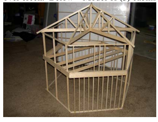
Letter From M.O.M. Volume 60 Aug. 2010