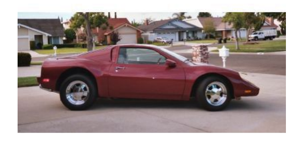
Daily driver, but getting mileage and needing some upkeep. This is a spinoff of the Dino Ferrari 246.