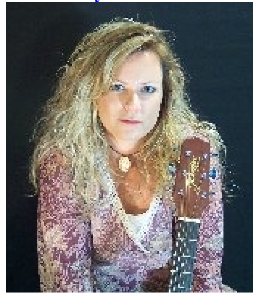
Corcoran – April 2010