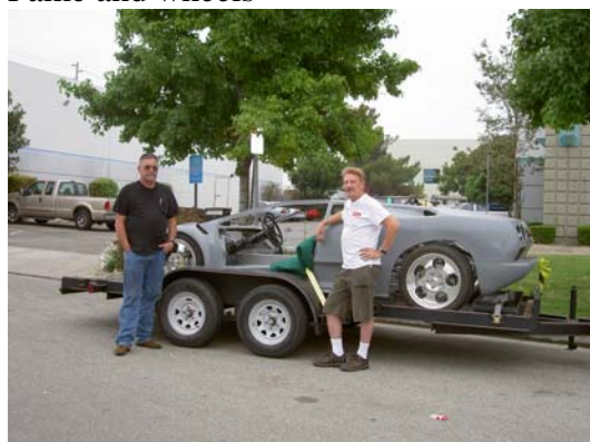
Receiving the body mounted on chassis.