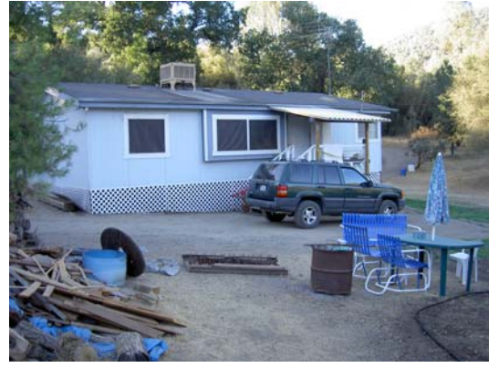
2 BR/2BA home – Cripple Creek