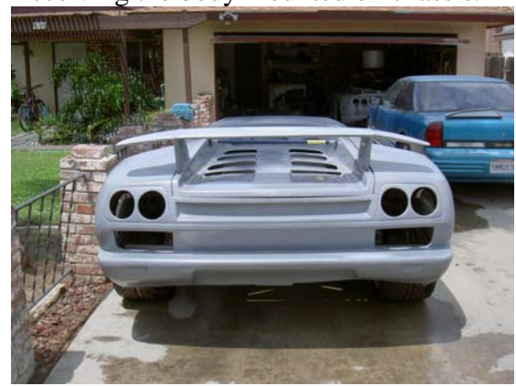
Rear engine cover and wing mounted.