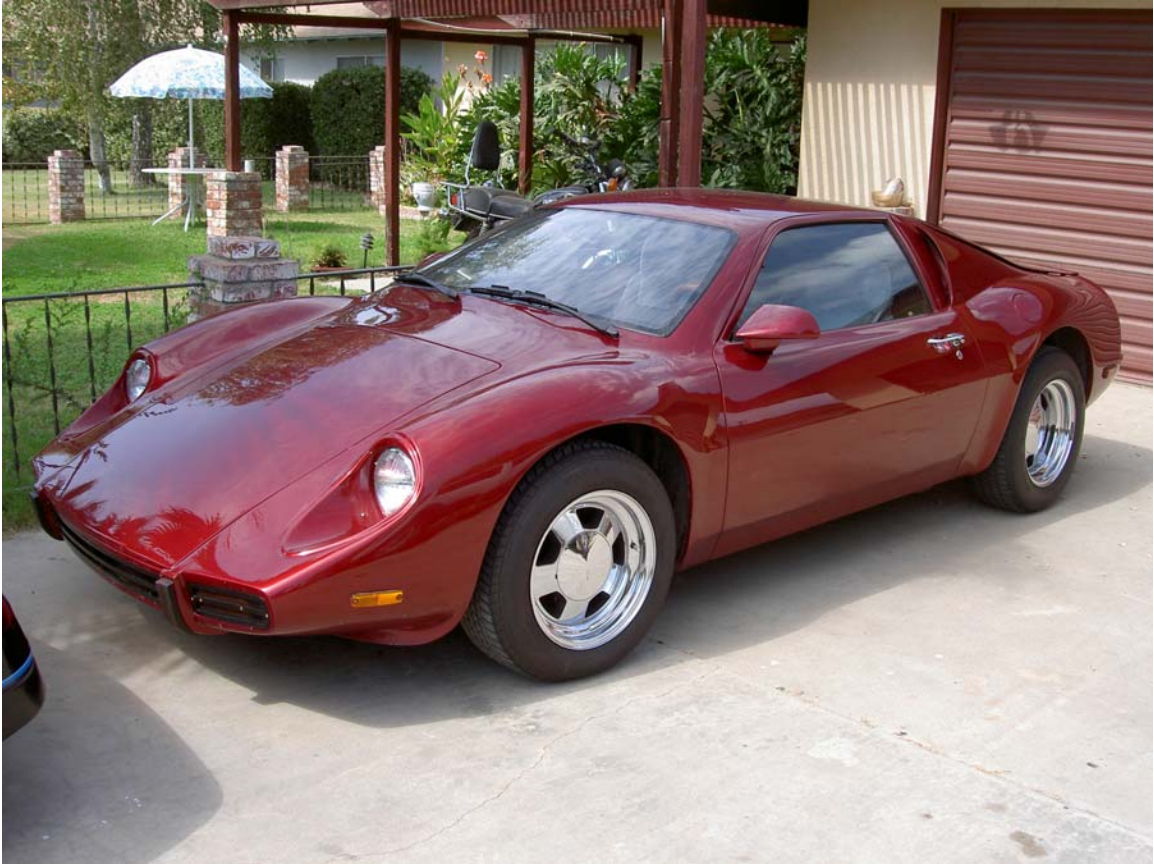
Chaplain Bob's Fiero 600 APRIL 2010