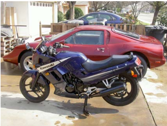
Cute little bike. It was actually too tall for Linda to reach the ground.