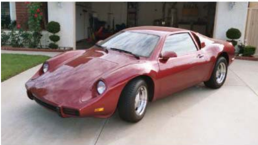
Chaplain Bob’s Fierro 600

Know which tool to use, when to use them, and how to use them. We need to develop skills with the tools we have.