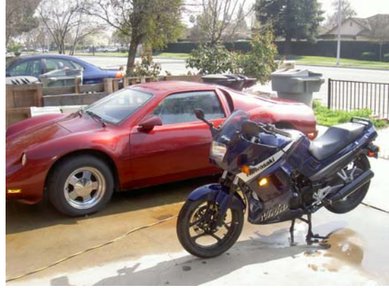
Bob's Fierro 600 in background Linda's Ninja in foreground.