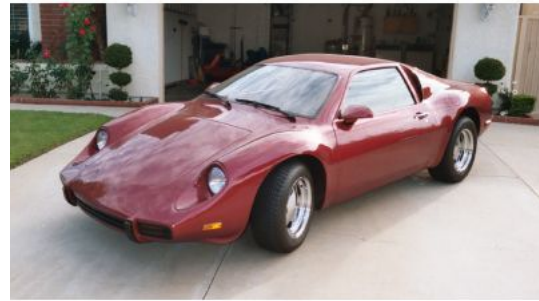
Car – Fierro 600

I’m not out on program.” I said, “You’d take my boots?” It was a nice time of talking and over the next 4 weeks of visiting sessions, we were able to talk and have a good time.