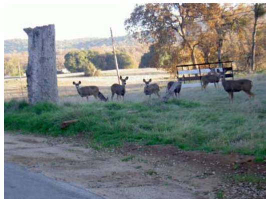
Local "wild" livestock watching activities. 7 deer in this picture.