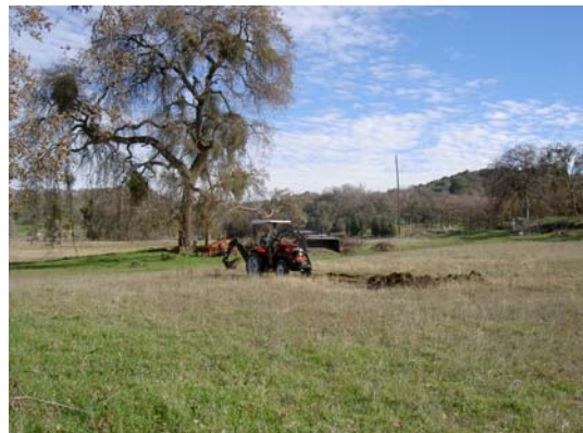
Here we were clearing an area where we had a controlled burn of the tree trimmings.