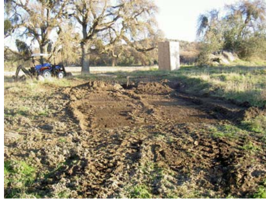
Clearing and leveling for concrete pad

The property is progressing slowly due to lack of finances, but still headed in a positive direction.