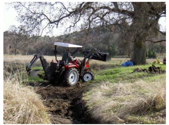
Clearing the creek and doing swimming hole.