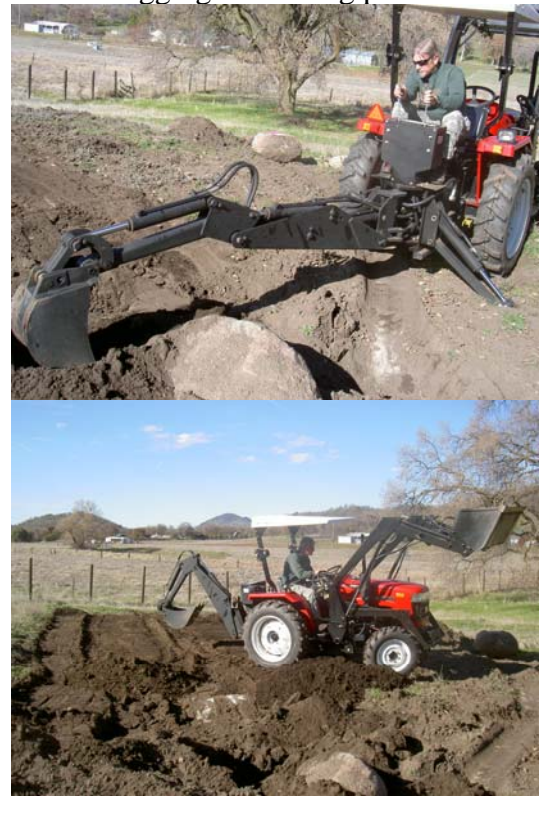
Letter From M.O.M. Volume 45 February 2009

Still working on rock removal. We refer to these as "potato rocks" because you do not see them until you start to dig.