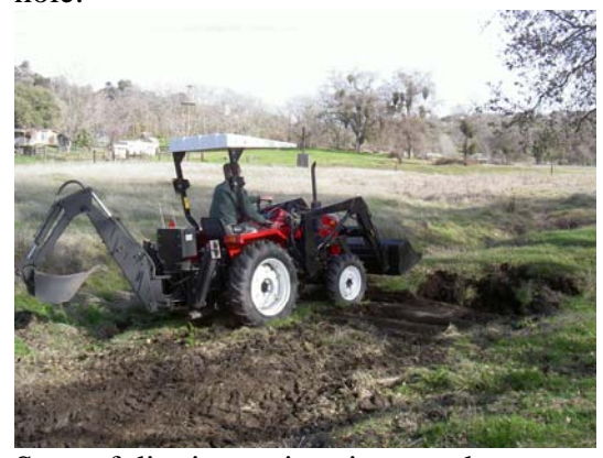
Start of digging swimming pond.