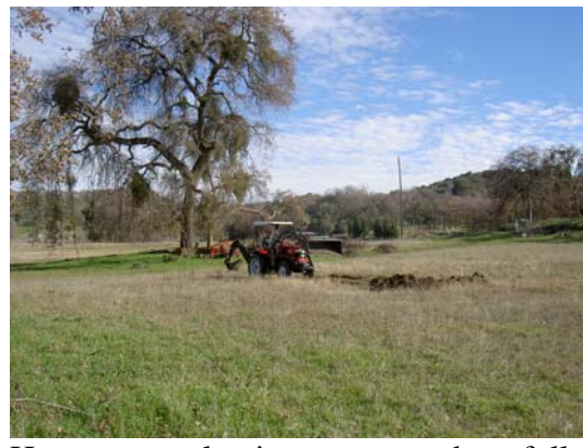
Here we are clearing an area to hopefully have a controlled burn of the tree trimmings.