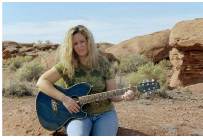
Bill Glass Champions for Life Ministry

Our scheduled events for 2009 with the Bill Glass Ministry are as follows;