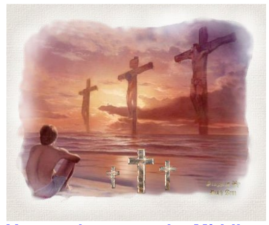
You can't cut out the Middle Man

and Good News Jail & Prison Ministry Volunteer www.GoodNewsJail.com