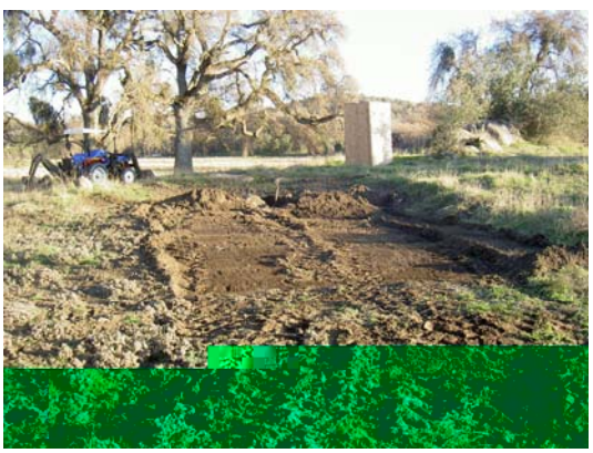
Clearing and leveling for concrete pad

The property is progressing slowly due to lack of finances, but still headed in a positive direction.