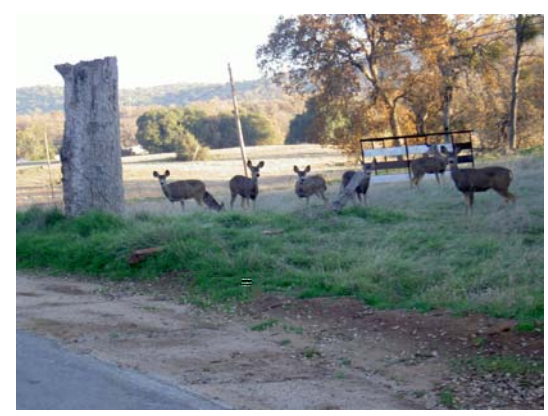
Local "wild" livestock watching activities. 7 deer in this picture.