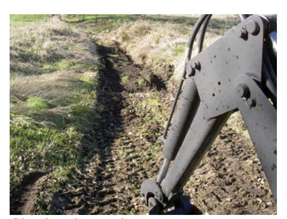
Clearing the creeks