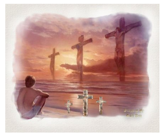
You can't cut out the Middle Man

and Good News Jail & Prison Ministry Volunteer www.GoodNewsJail.com