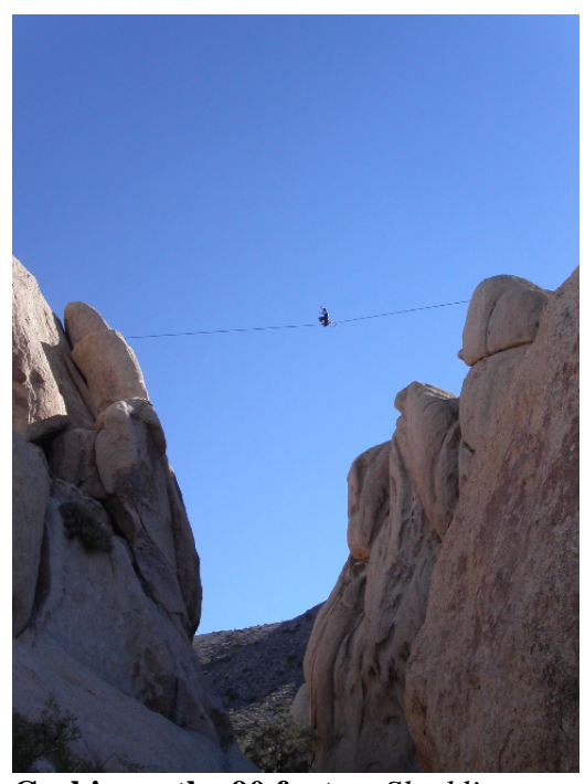
Corbin on the 90 footer, Slackline Brothers Inc. © 2006