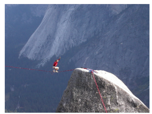
The long Spire line ~120 ft. long - 2890 feet above the valley floor - First walk: Shawn Snyder, summer 2003