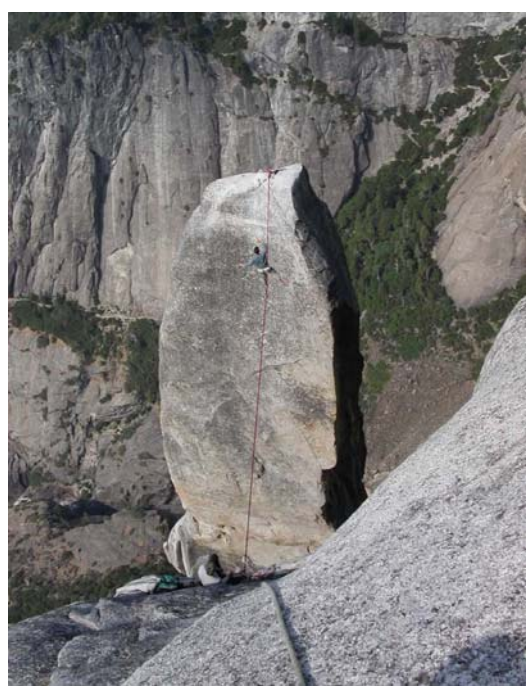
Wes Ellis at the Lost Arrow Spire