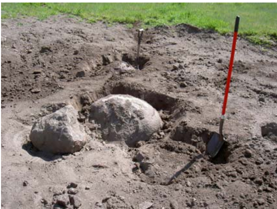
Rocks are being removed. Bob refers to these as “Potato Rocks” because you only find them when you start to dig.