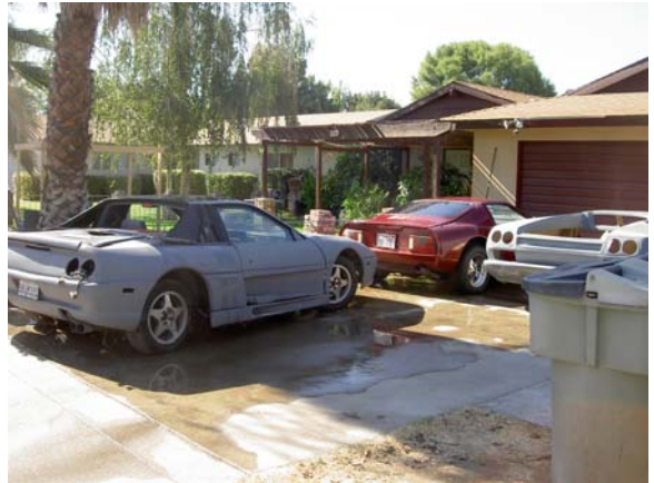
Ferrari F355 replica

The Diabolic 6.0 has had a custom tubular chassis added to it to produce a more "fun toy." The body kit consists of 17 pieces