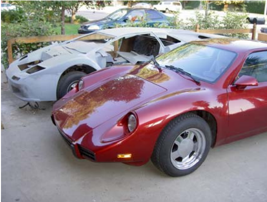
Fiero 600 and Lamborghini Diablo 6.0 replica in back.