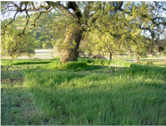
Trees are green and growing