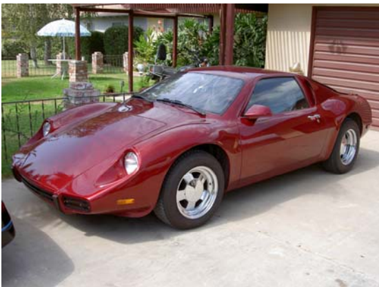
Fiero 600 as Bob uses it in ministry.

The Diabolic 6.0 has had a custom tubular chassis added to it to produce a more "fun toy." The body kit consists of 17 pieces