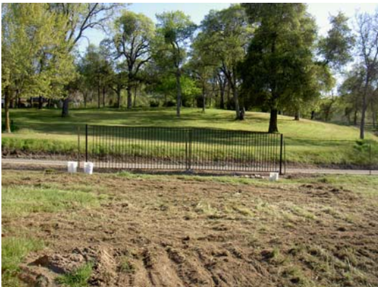
24 foot gate was installed