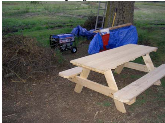
Picnic table has been assembled, generator is available, and the most important “outhouse” while waiting for plumbing, septic, and power.