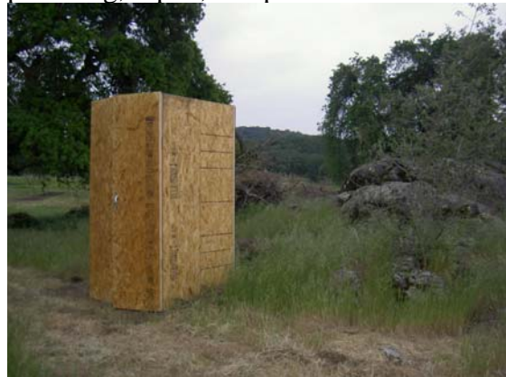
We recently held a Bar-B-Q on the property and had a wonderful time.