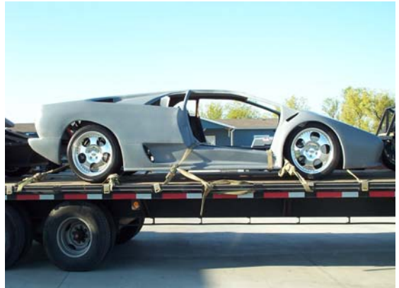
Diabolic 6.0 body as manufactured.