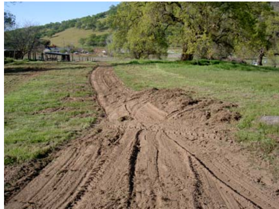
Drives are scraped and leveled