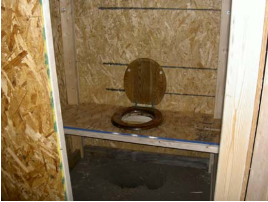
Outhouse open for business