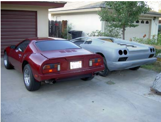
The Fiero 600 was a daily driver for Bob. He relates it to how individuals do not like solitude, neither do cars. This is a "shown car" rather than a "show car."