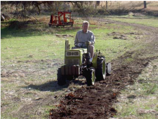
Driveways are being formed