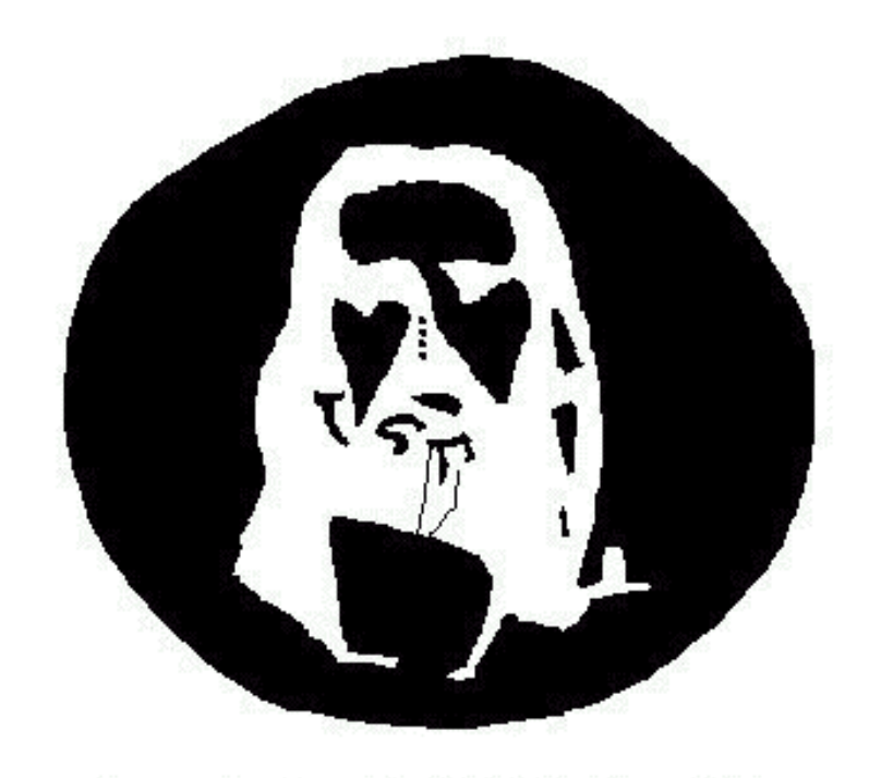
Concentrate on the 4 dots in the middle of the picture for about 30 secs.