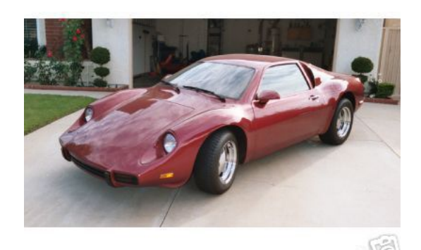
Car - Fierro 600

I'm not out on program." I said, "You'd take my boots?" It was a nice time of talking and over the next 4 weeks of visiting sessions, we were able to talk and have a good time.