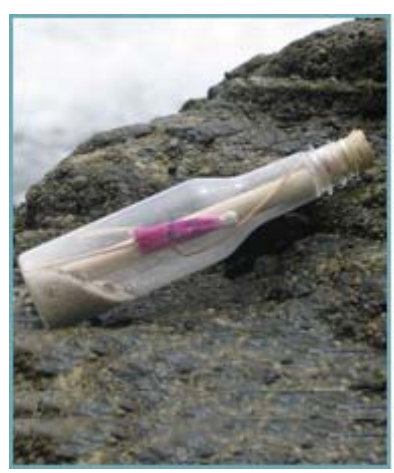
The following article is another of "Message in a Bottle" in tribute to NW,

This fine young lady has completed her GED program while in prison in Idaho. We are very proud of her