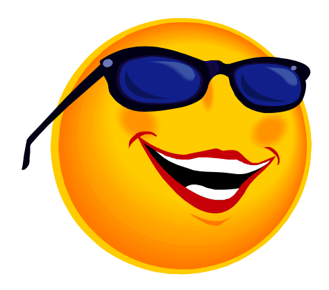
Preguntas? Yo no soy escolar pero si trato de obtener repuestas con el mapa que tenemos: LA BIBLIA.....:>) Dios te ama 100%