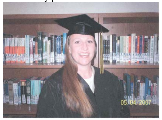
Cap and Gown Picture

This fine young lady has completed her GED program while in prison in Idaho. We are very proud of her