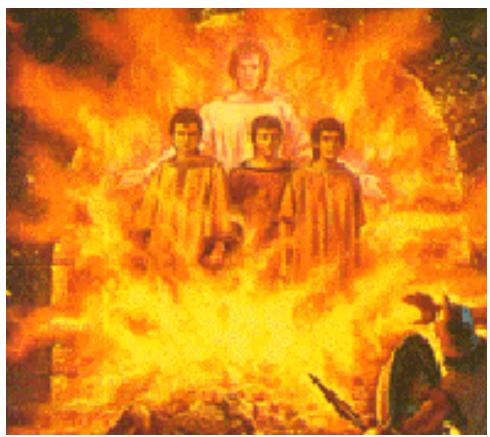
Three Men Invited to a Bar-B-Q

kingdom work. We look at the effectiveness of the fruit in our life through our children, our friends, etc. Who do we hook up with?