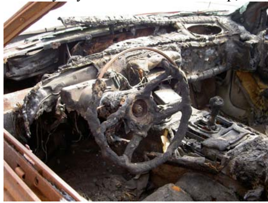
But my inside was also messed up.