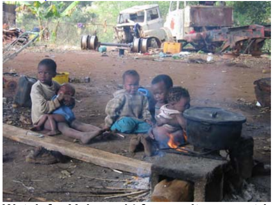
Watch for Volume 14 for results or our trip.